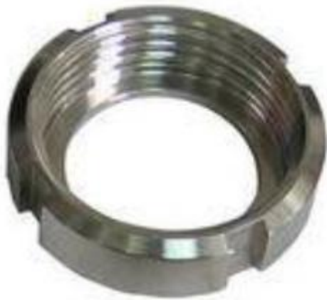
DIN 11851 Nut